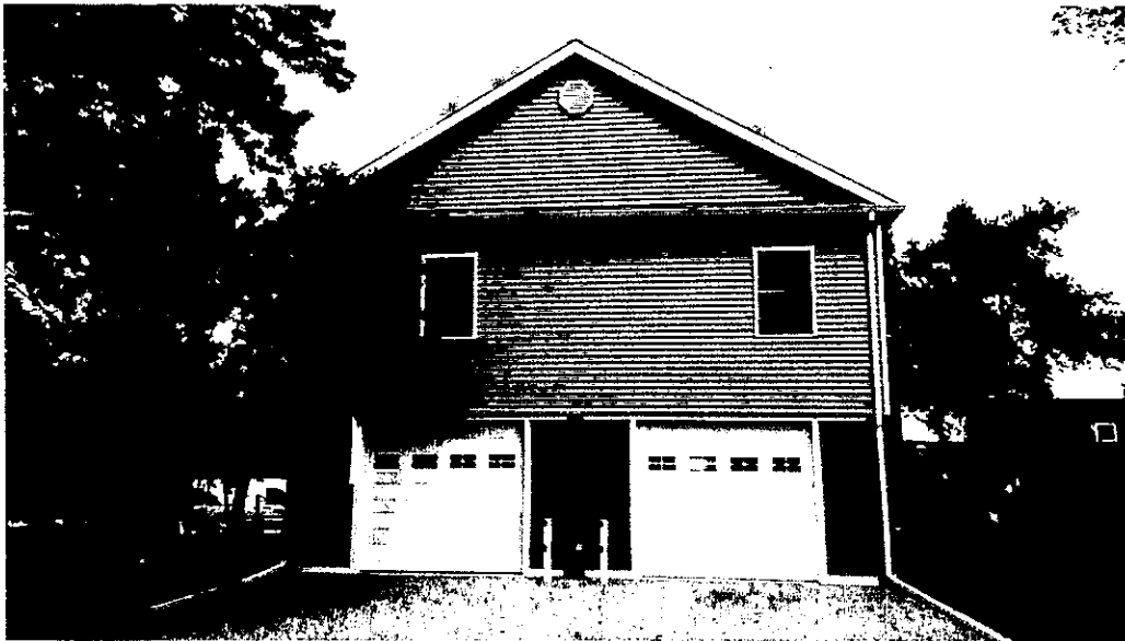
RIGHT SIDE VIEW – 06/29/2015

If submitting more photographs than will fit on the preceding page, affix the additional photographs below. Identify all photographs with: date taken; "Front View" and "Rear View"; and, if required, "Right Side View" and "Left Side View." When applicable, photographs must show the foundation with representative examples of the flood openings or vents, as indicated in Section A8.