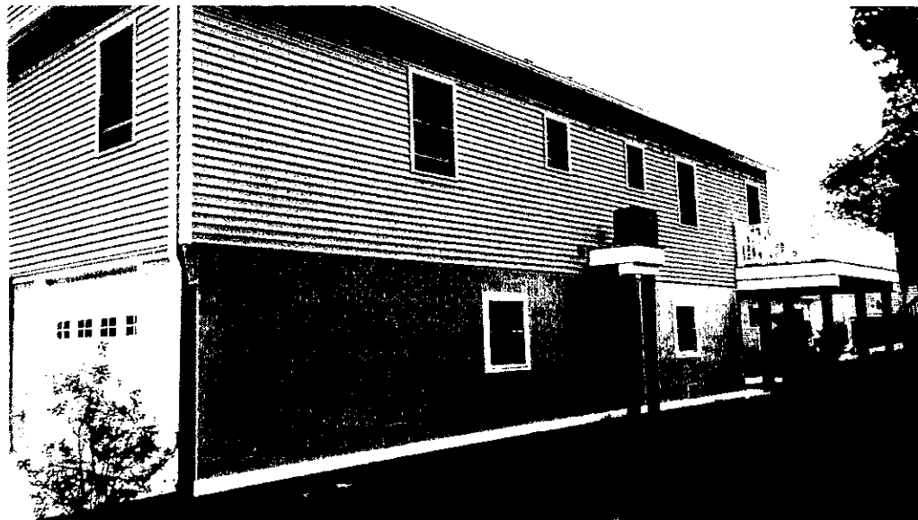
REAR VIEW – 06/29/2015