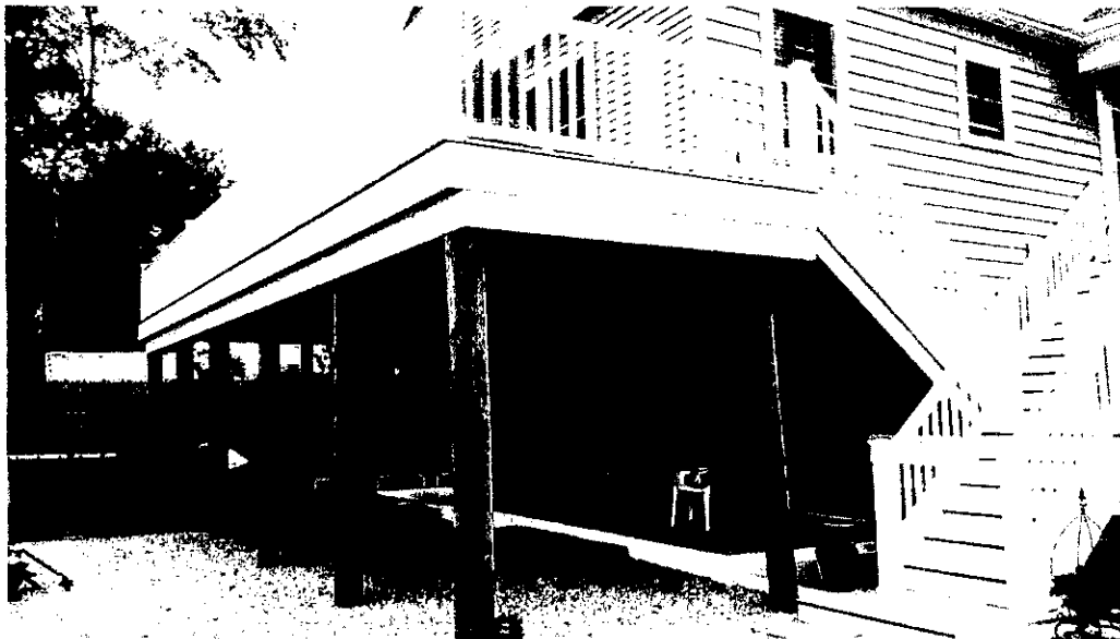
FRONT LEFT SIDE VIEW – 06/29/2015