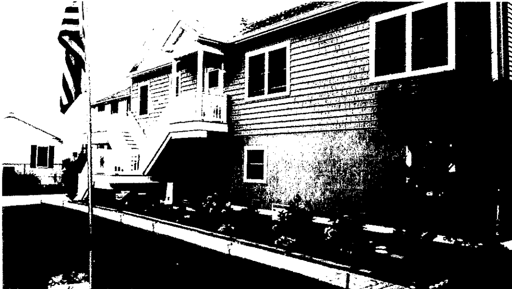
FRONT VIEW – 06/29/2015

If using the Elevation Certificate to obtain NFIP flood insurance, affix at least 2 building photographs below according to the instructions for Item A6. Identify all photographs with date taken; "Front View" and "Rear View"; and, if required, "Right Side View" and "Left Side View." When applicable, photographs must show the foundation with representative examples of the flood openings or vents, as indicated in Section A8. If submitting more photographs than will fit on this page, use the Continuation Page.